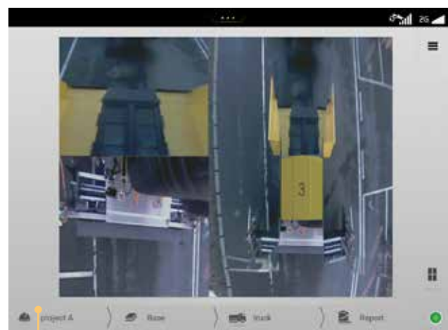
Volvo Smart View