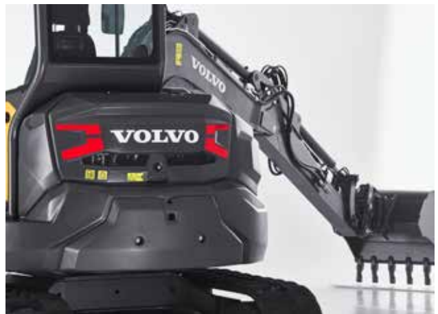
Long arm, extra counterweight