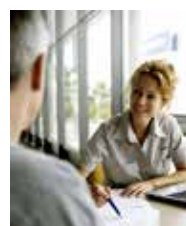
Volvo Financial Services