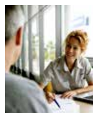
Volvo Financial Services