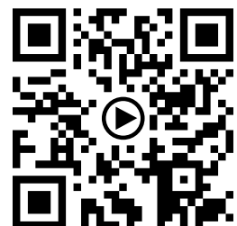
Insight Reports video

With insights into the health, efficiency and productivity of your machines, the reports help make informed decisions and identify ways to reduce operating costs.